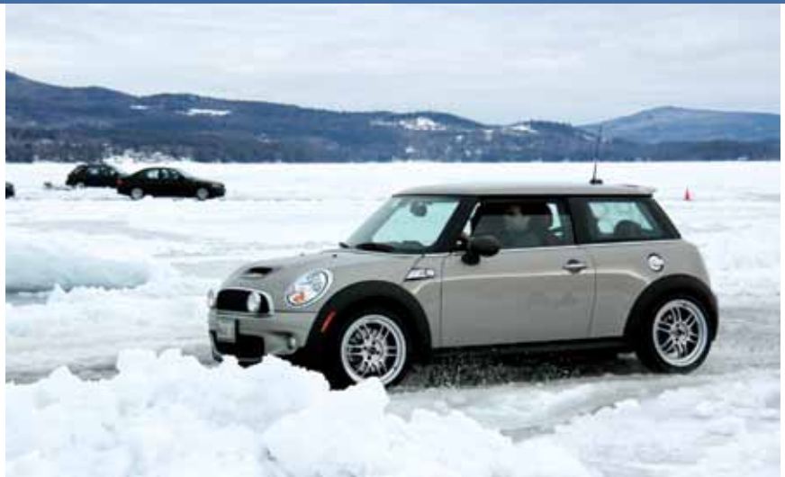
Ice Racing allows you to sharpen your driving skills under the absolute worst road conditions.

Hamshire. Because we are driving cars on a frozen lake, many precautions have to be taken to make sure the ice and the course are safe. Since we don't have a Zamboni to clear the track for us, we use a pick-up truck with a snowplow to clear a course. If there is a lot of snow, the track may have tall snow banks. When it's cold with little snow it's like driving on glass. But if it warms up enough, that glass begins to develop a surprising amount of traction. It's always thrilling! It's important to read the Bulletin, because when the ice or the weather conditions aren't right, we don't race. So don't show up without checking the weekly update.