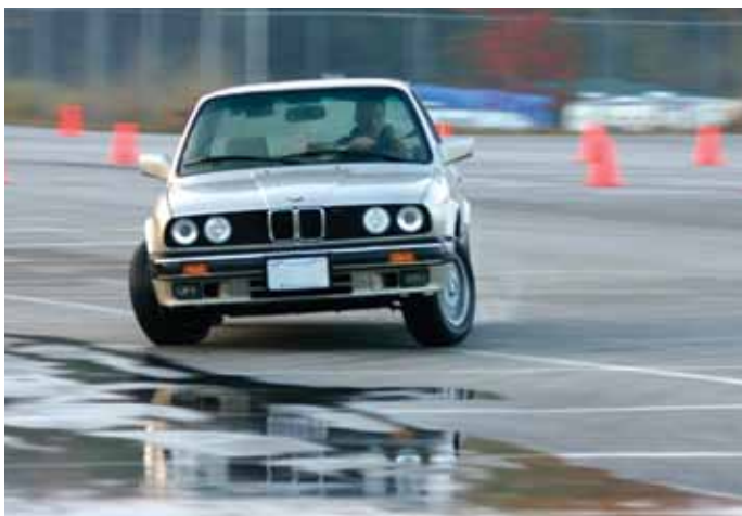
Above: During the hands on portion of the program, a student practices the skills taught in the classroom on the track.

Braking: The braking exercises allow students to learn braking with ABS, threshold braking, braking