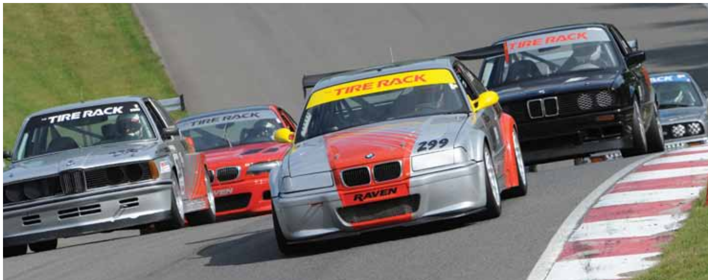
Another exciting shot of club racing at the annual Bimmer Across the Borders event held at Mont Tremblant, Canada.

Racing School, (Boston Chapter normally sponsors a school each year) preparing your car and applying for a license. There are variations on this process and you should check out the Club Racing web site for details, but the bottom line is you need experience and training to qualify for a license. A BMW Club Racing competition license is recognized by most racing sanctioning bodies and can open the door to a variety of racing opportunities. If you are interested in checking out club