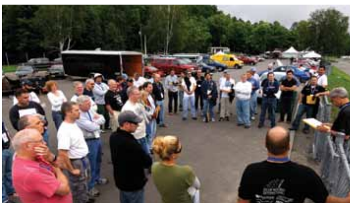
A morning Drivers’ Meeting at Mont Tremblant brings everyone together for a review of safety guidelines and a chance to meet new participants and develop friendships.

The Chapter uses PayPal for driving school registration fees. If you are accepted you will be sent an email