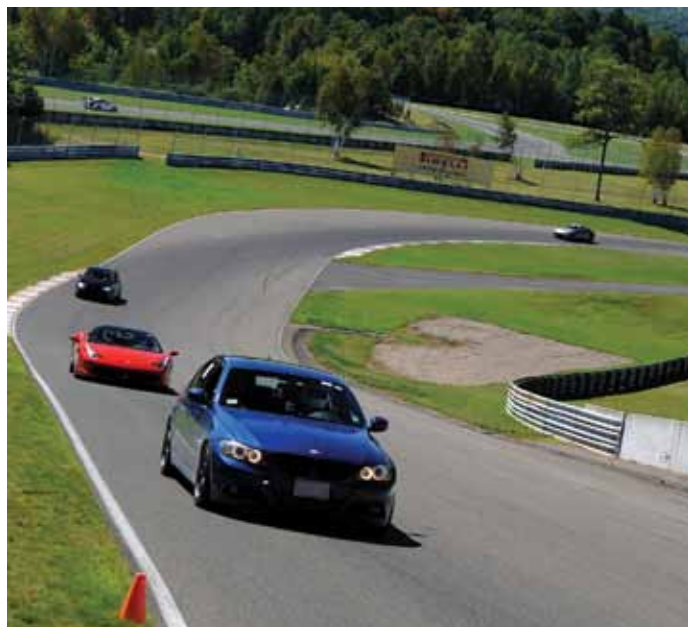
Top: The Boston Chapter's home track for high performance driving schools is New Hampshire Motor Speedway, shown here.