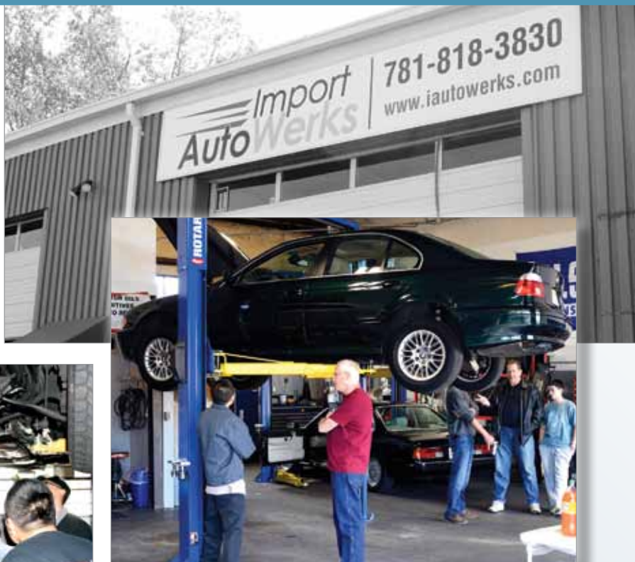
Above: Import AutoWerks' new facility in Braintree has already been the setting for a Boston Chapter tech session in 2011, with more to come in the future.

Since 2009 Import Autowerks has regularly sponsored Undercarriage Tech Sessions for the Boston