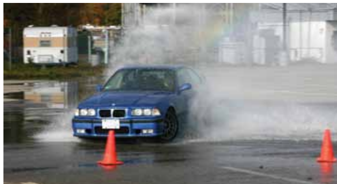
Photos from top to bottom: The course for Advanced Driving Skills School is in a picturesque setting, especially in the Fall.