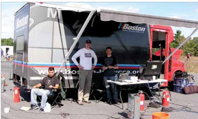
Above, top: One new addition to the Autocross team is a new van that houses all the equipment and sports the new Boston Chapter logo.