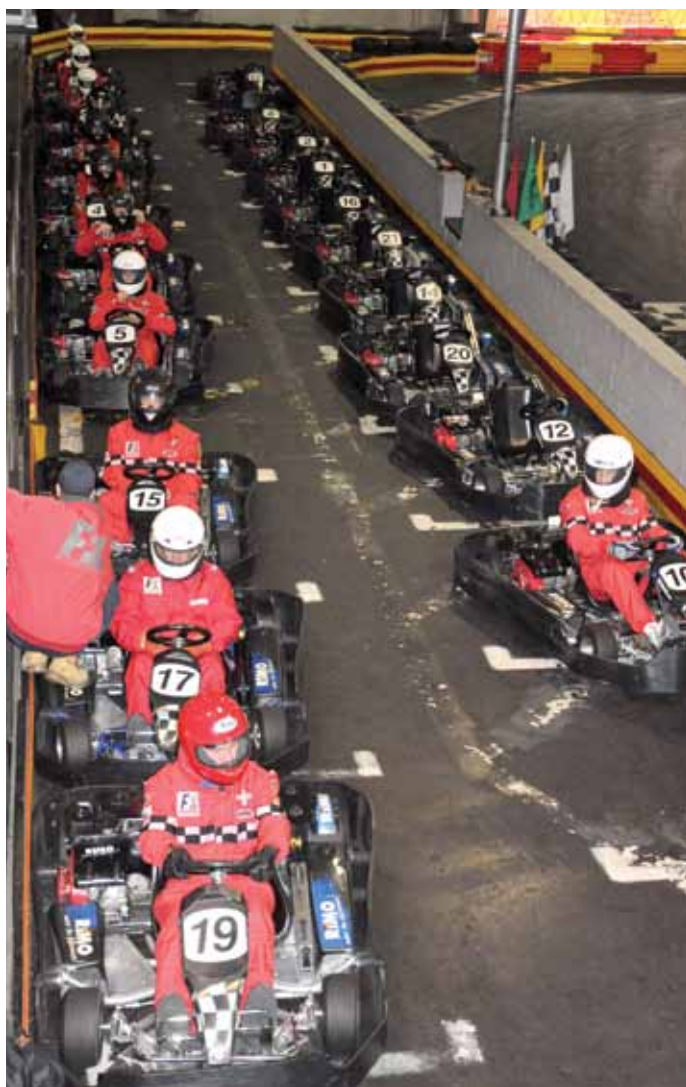
Above: Boston Chapter members are suited up and ready for the start of a run on the F1 Boston Indoor track.

Since you have to earn your spot in the Indoor Karting Challenge Championship Round by your performance