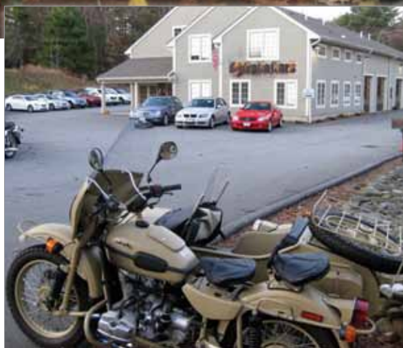
Pictured at left is a legendary Russian URAL motorcycle with 2 wheel drive and infamous sidecar. AlphaCars is among a handful of U.S. dealers for these unique motorcycles.

knowledge of foreign cars. As a small company, they can provide personalized service and special attention to every customer and to each job. They also strive to offer only the best cars – ones you will be proud to own and excited to drive.