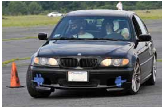
All cars, old or new, stock or modified, are classified by their ability. Cars in each autocross class are well matched to be competitive against.

in signing in with your worker boss, so we can minimize downtime. Our goal is to maximize the fun, on-track experience.