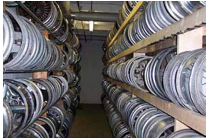
Above: The back room at Rim & Wheel Works in Waltham, MA.