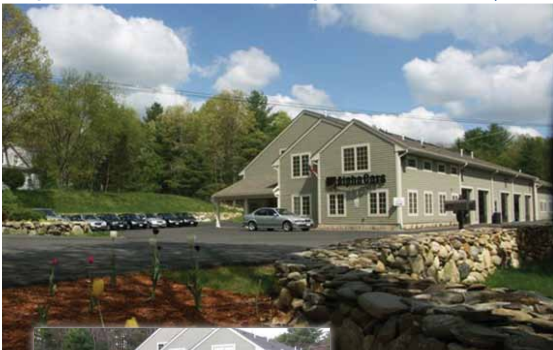
Pictured above, the AlphaCars headquarters on Route 111 in Boxborough, MA.

Their facilities, tools, equipment, and technologies are constantly upgraded in order to stay in step with the rapidly changing automotive industry. However, they feel the key to their success lies in prompt, courteous service coupled with an unsurpassed