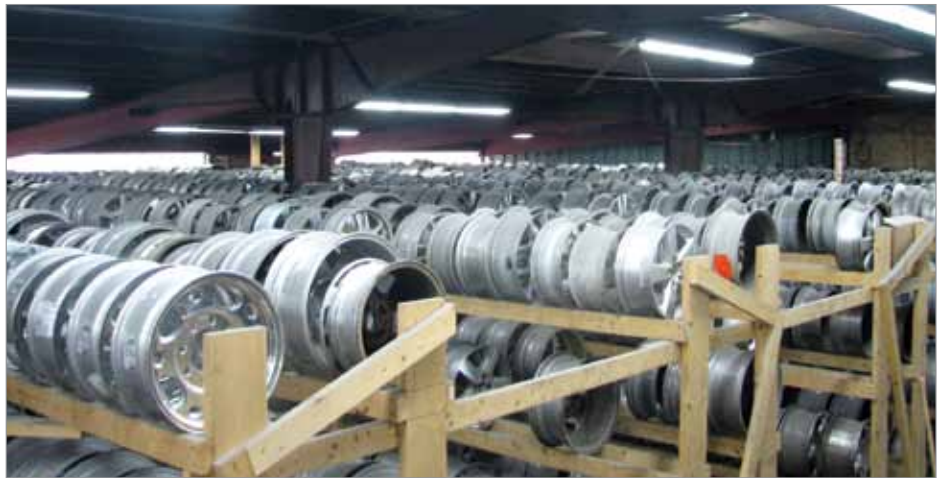
Missing an original equipment (OE) wheel? RIMPRO buys OE wheels and keeps an in-house inventory of over 5,000 OE wheels, pictured here in their inventory.

So if you are looking for professional Wheel and rim services, Rimpro is a great fit. Rimpro, Inc. is located at 860 East Street; Tewksbury, MA 01876. They can be reached by phone at 1-888-2-RIMPRO(274-6776) They are conveniently located between Route 93 (exit 42) and Route 495 (exit 38). They are on the Web at www.rimpro.com . ♦